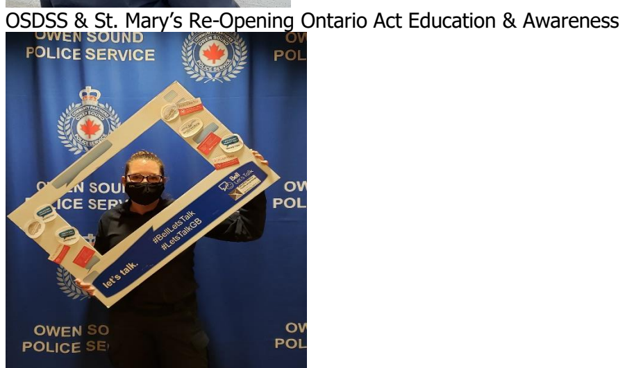
Bell Let's Talk Day 2021